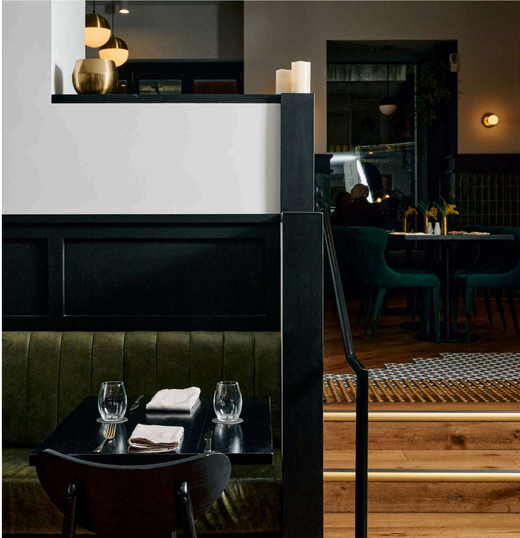
MISTER MUNRO PRIVATE DINING