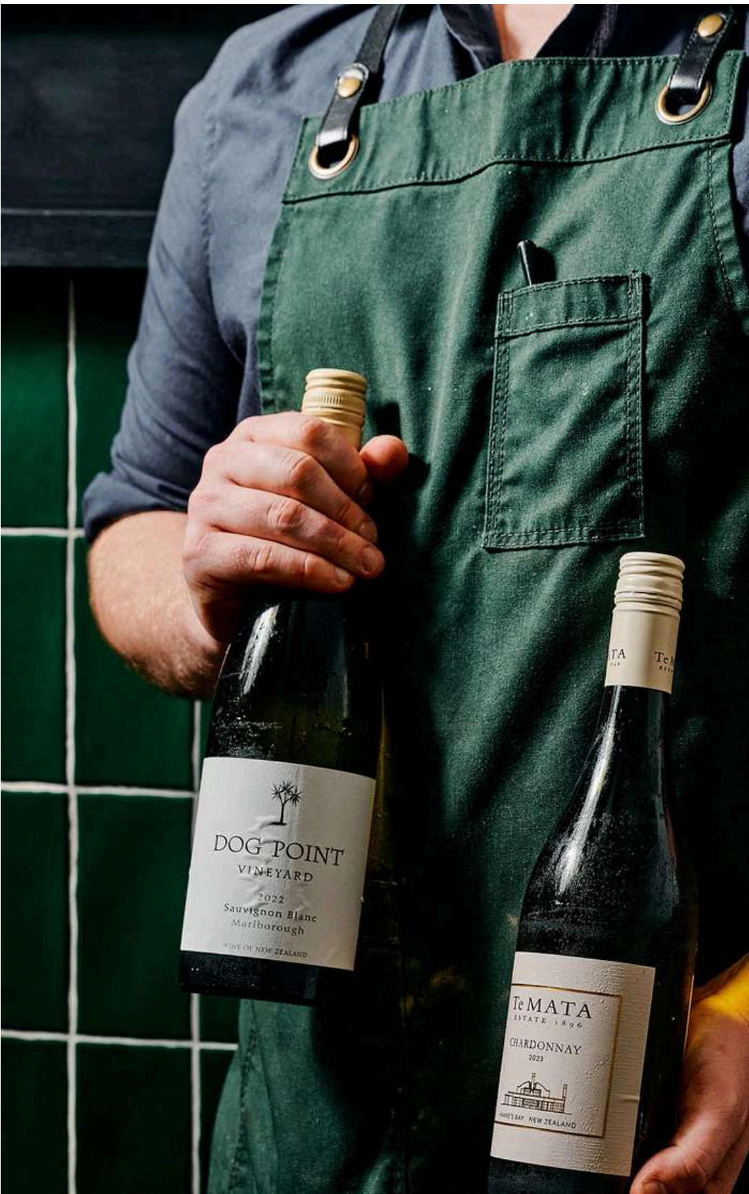
Beverage packages must be booked alongside a food package and apply to the entire group.