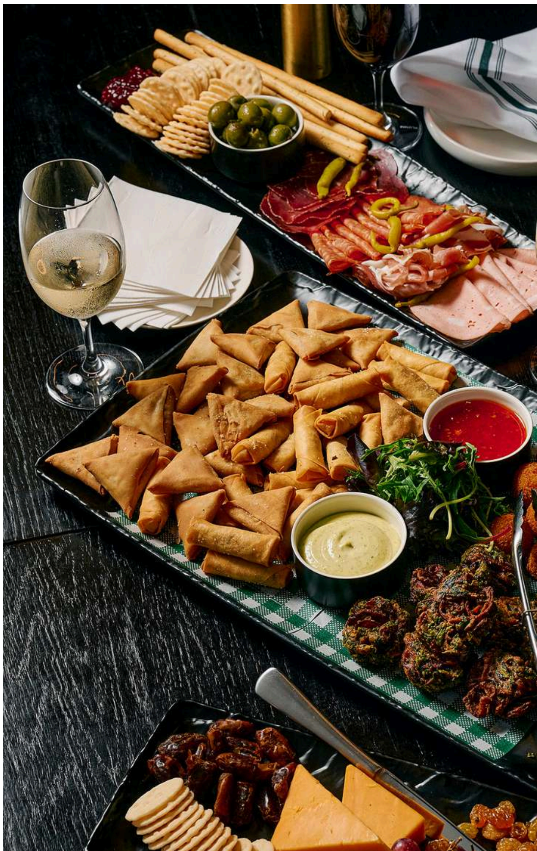
MISTER MUNRO PRIVATE DINING